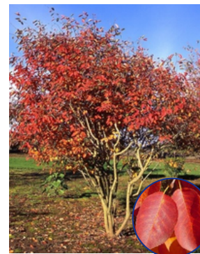
Autumn Brilliance Service Berry

*We are not accepting additional trees for Riverside Park at this time.