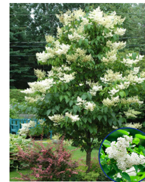
Ivory Silk Japanese Lilac