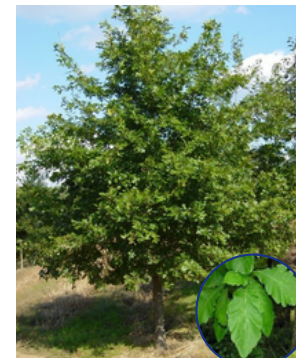
Swamp White Oak *Spring Planting Only